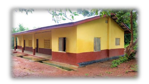
Foya RC Primary School (post-intervention)