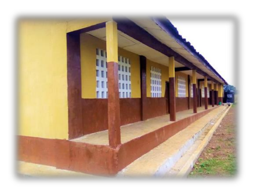
Koinadugu II Primary School (post-intervention)