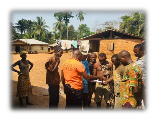
Discussions with the workers for the BDEC Kpetema Primary School, Valunia

Two additional components were also facilitated as part of the project. The first comprised of the land survey documentation executed to support each facility with their Government approval process from the Ministry of Basic and Senior Secondary Education. The approval of a school in Sierra Leone equates to a greater chance of receiving Government funds, adoption into the formal Government system in terms of curriculum, the potential for teachers to receive a salary and a stipend for teaching materials. Overall the approval of a school encourages sustainable education which is vital for the rural communities Street Child works with. The second component is a 'start up' materials package for the new academic year. This pack includes textbooks and other key teaching and learning materials.