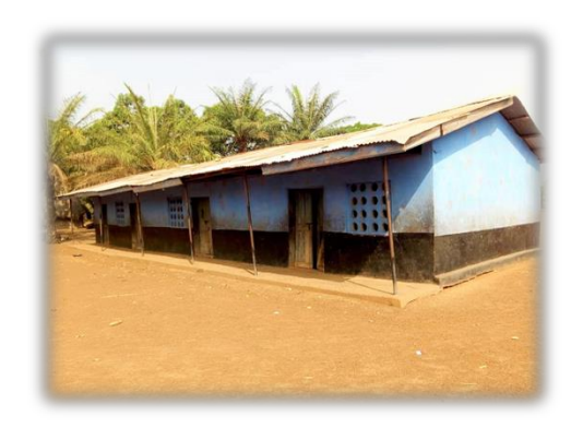
RC Tomporay Primary School (pre-intervention)

The amalgamation between the two organisations contributes greatly to the alleviation of Sierra Leone's unseen education crisis and fulfil a child's right to go to school.