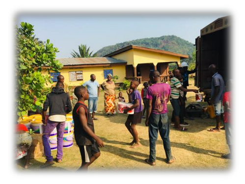
Delivery of materials in Pelewahun 2 for Hinganorman Memorial Primary, Valunia