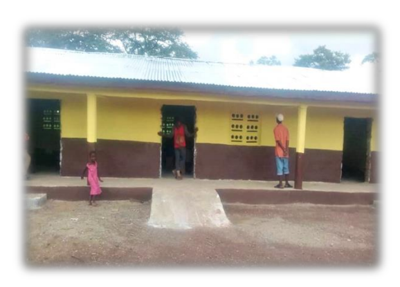
Kantimpie WCSL Primary School (post-intervention)