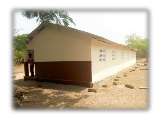
RC Tomporay Primary School (post-intervention)